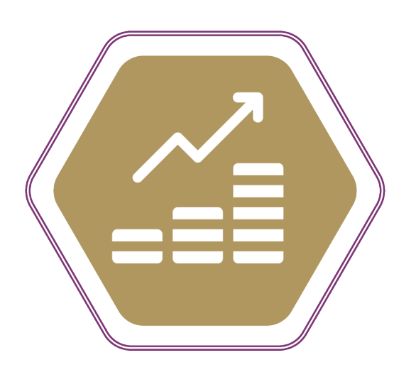
Increased Investment Capacity