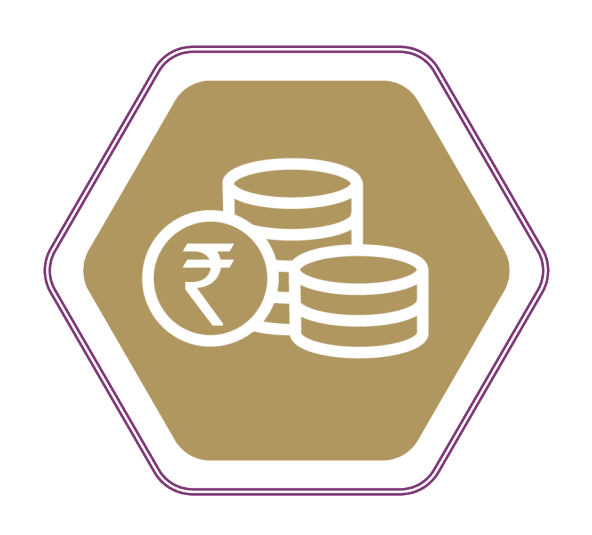
Additional Exposure on Existing Shares